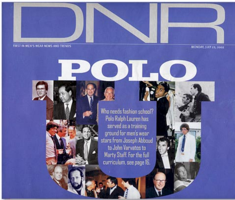
SAL CESARANI WITH RALPH LAUREN IN GREECE, EARLY '70S